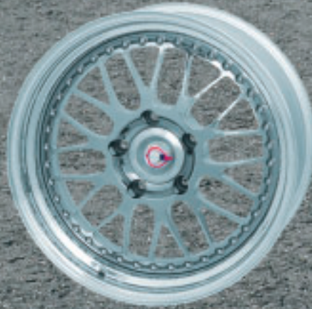
Surcharge center SLC-chrome Part.-No.: CAR5130SLCCHROM