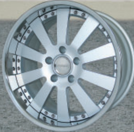
21" with stainless steel flat rim