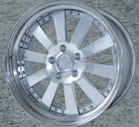
Surcharge center polished Part.-No.: CAR5130POLISH