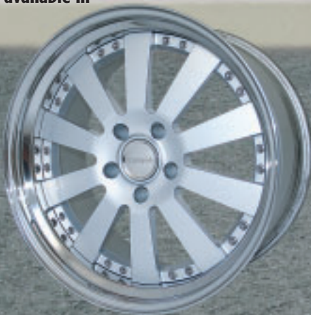
20" with stainless steel step rim