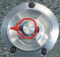
Center lock dummy Part.-No.: CAR41910050

cargraphic wheels are the absolute finest 3 piece wheels on the market. This 3 piece high quality product "Made in Germany" incorporates the strongest, lightest and most durable components such as: • Heat treated cast stars or, • Spun forged machined stars, • Handpolished stainless steel outer rims, • Reinforced inner rims, • Internal bead retainer for secure and perfect tire fit as prescribed by TÜV standards, • Stainless steel bolts. Race proven on the worlds most challenging race tracks the cargraphic RACING wheel is the world record holder on the Nürburgring Nordschleife. All wheels are TÜV approved with extreme high wheel loads, thereby insuring the highest quality and construction. The wheels are available in the following finishes: standard: silver center; custom: black center, SLC-chrome center, painted in any colour. A cargraphic stainless steel centercap is included or optional for a high tech finishing touch opt for a set of cargraphic center lock dummies.