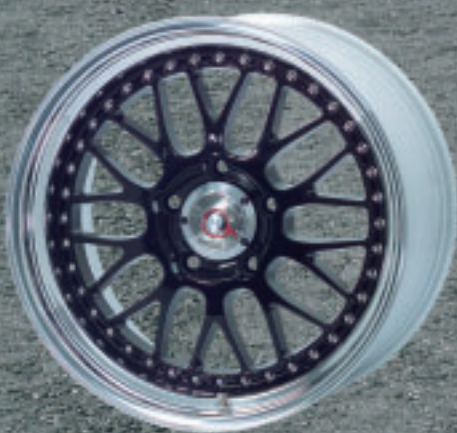
Surcharge paint center black Part.-No.: CAR5130BLACK