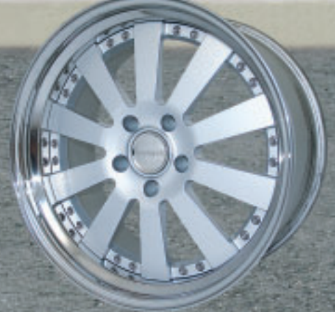
22" with stainless steel step rim