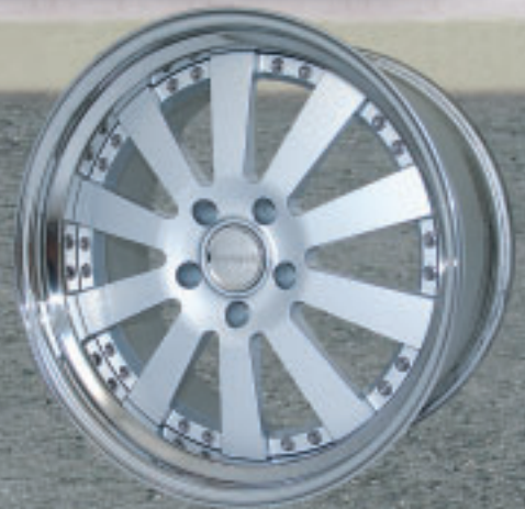
22" with stainless steel step rim