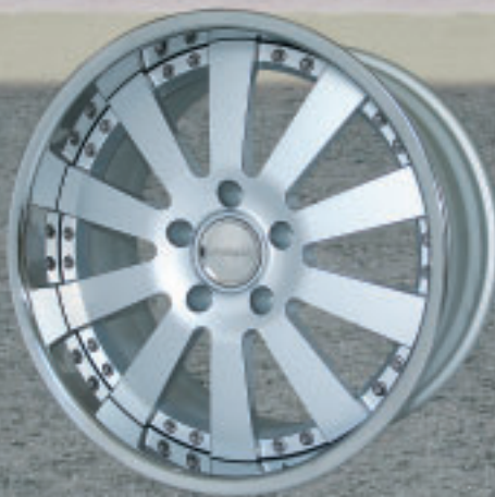
21" with stainless steel flat rim